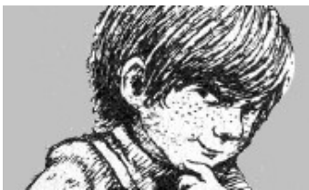
Meet Tom—the “Great Brain” who has a money-loving heart!

Here is a great book about a young boy who has two older brothers. They live in Adenville, Utah, in 1896. J.D. is the youngest brother, and Sweyn is the oldest brother, but the brother who is the most interesting is Tom—the middle brother. He is known as the “Great Brain” because he is so much smarter than everyone else. Each chapter of this awesome book is about how Tom uses his great mind to help people out. Unfortunately, in addition to a great brain, Tom also has a “money-loving” heart, and many of his exploits are designed to fill his pockets. When J.D. tells the stories about his brothers adventures, they often end with Tom getting in trouble for cheating others out of money.